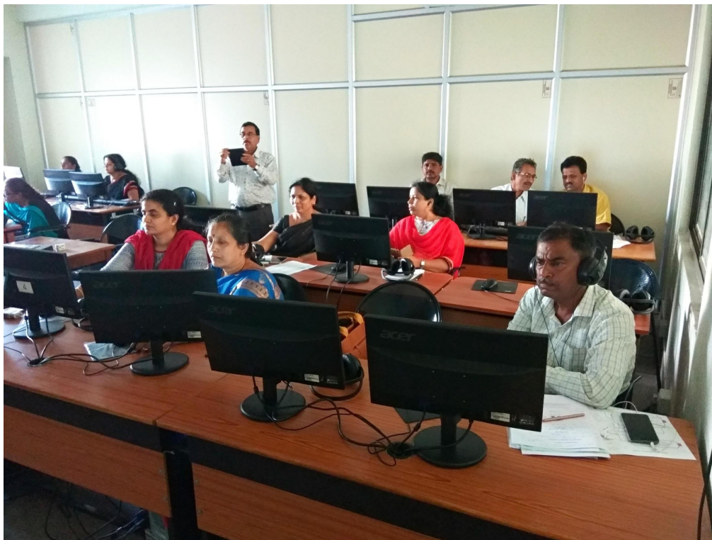
Students exploring E-resources

TISSx was offered to access unique resources and courses, and support learners through mobile-based communities of practice, has been shaped and developed through this innovative effort. Through TISSx we aim to reach learners in a wider range of settings and offer them unique, relevant, high-quality opportunities for continuous learning and professional development. TISSx can be accessed through a range of devices: desktops, laptops, tablets, and mobile phones. The TISSx Android app can be downloaded from the Google Play Store.